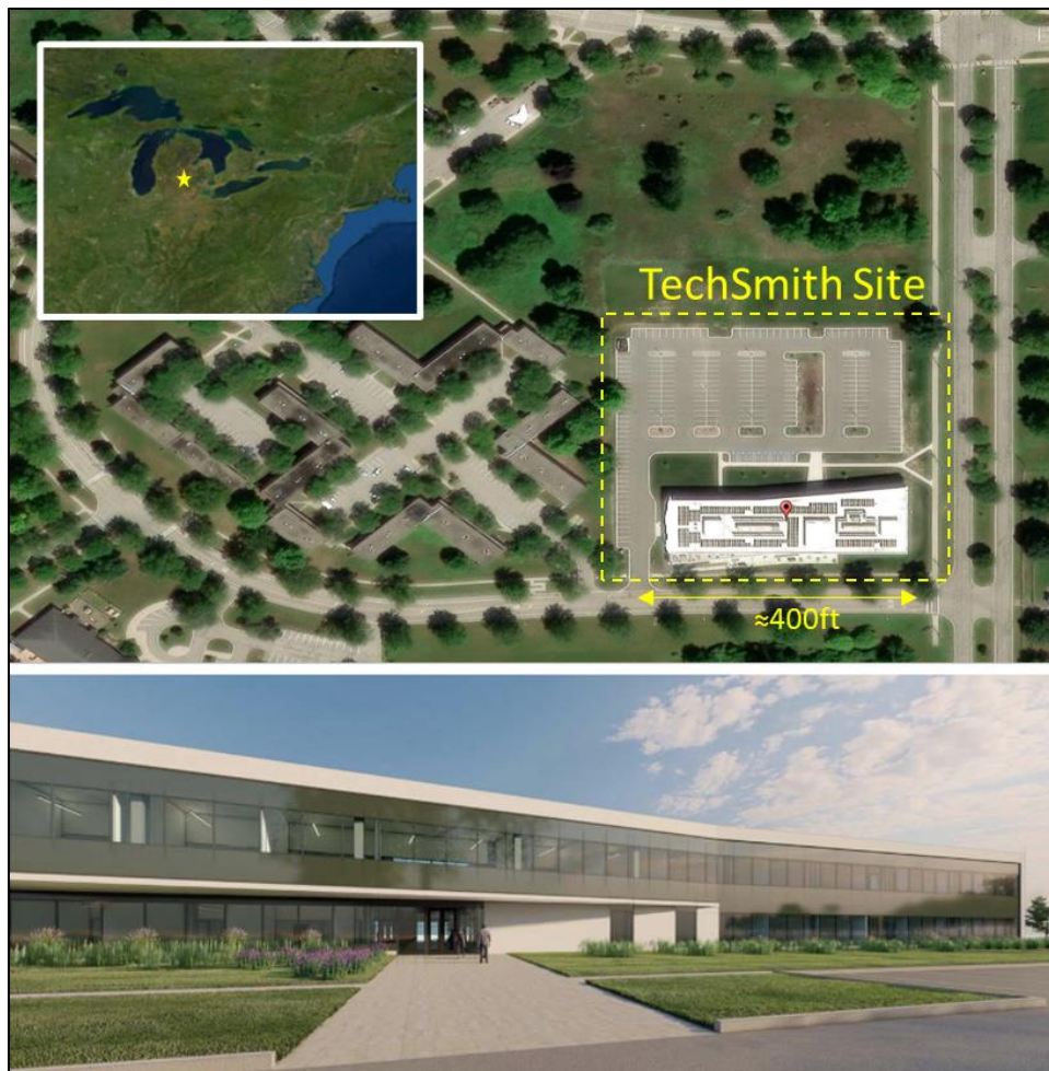
Figure 1 – TechSmith site location on the campus of Michigan State University.

You are hired to analyze (and improve upon) a design for a stormwater management system for the TechSmith headquarters located on the Michigan State University campus in East Lansing, Michigan (Figure 1). Stormwater captured by buildings, sidewalks and other paved areas is to be conveyed to an on-site holding pond through a proposed system of junctions (manholes) and conduits (pipes). Using a sophisticated simulation software – MAGNET4WATER StormNET - you will design (and then refine) the pipes (including their sizes, slopes, and roughness) and a holding pond (total volume, dimensions, and outflow control structures). You will also assess potential impact of Low Impact Development (LID) controls or other green infrastructure integrated into the system.